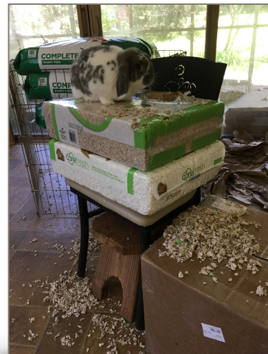
Bucky Billy shows his appreciation for a donation of Care Fresh bedding! Party on!