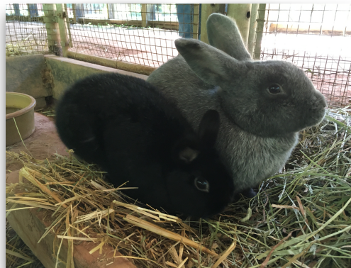
Artemus & Clover